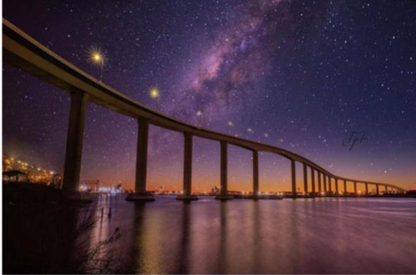
Pictured above: The night sky changes daily, but this simple capture of the bridge silhouetted against a sparkling Milky Way is a view we could stare at forever.